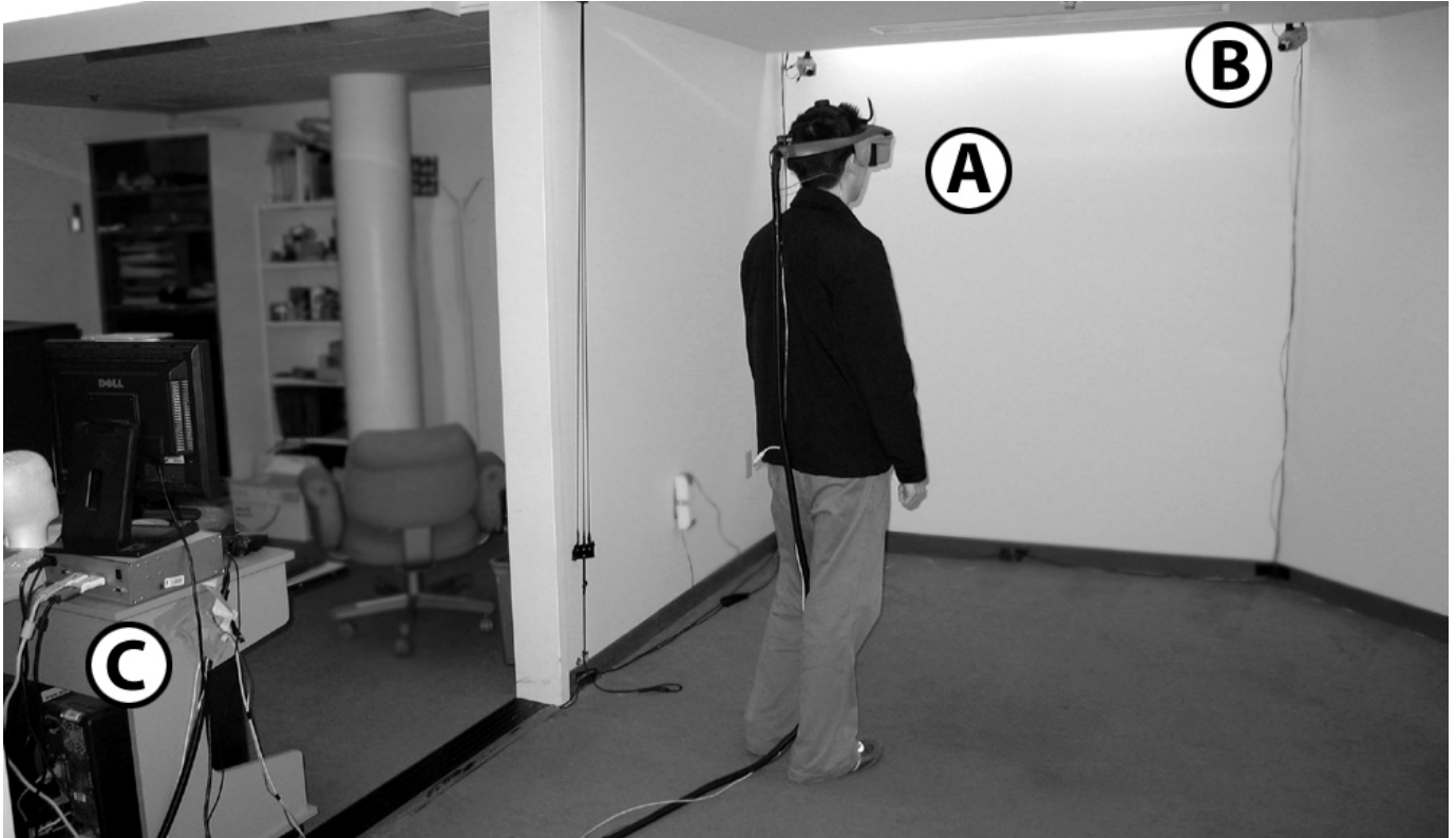
Figure 2 - Equipment setup: A) head-mounted display, B) tracking camera, C) rendering machine.

scale (labeled as 16-25, 26-35, 36-45, 46-55, 56-65, 66-75) as well as rate the attractiveness of the individual on a 7-point fully-labeled scale (from “Extremely Attractive” to “Extremely Unattractive”).