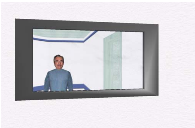
Figure 3 - Screenshot of participant's point of view in the virtual room with the mirror when he is embodied in an elderly avatar.

After informed consent, participants were told that the goal of the experiment was to study social interaction in virtual environments and that they would be having a conversation with another person in a virtual environment. Participants were then led into the room with the black curtain and shown how to wear and adjust the HMD. Once the virtual world was loaded, participants saw themselves in a room that was exactly the same dimensions as the physical lab room, as depicted in Figure 3. The research assistant drew open the curtains at this point.