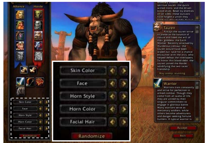
Figure 1. Character creation interface in WoW (available options have been magnified in all figures)

In the second part, we asked our participants to rate a large number of statements about their avatar using a standard 5-point Likert scale. Example statements include "I make avatars that stand out as much as possible" or "I make avatars that reflect a popular trend." These statements (defined in previous research, see [7]) were used to understand the thought process governing avatar customization for each user. Our participants were then asked to compare themselves to their avatar along a number of dimensions, both physical (e.g. height) and psychological (e.g. assertiveness). The latter was accomplished using a methodology identical to the one described in [2]. We then tried to assess our participants' level of attachment to their avatar by having them rate statements such as "I would be