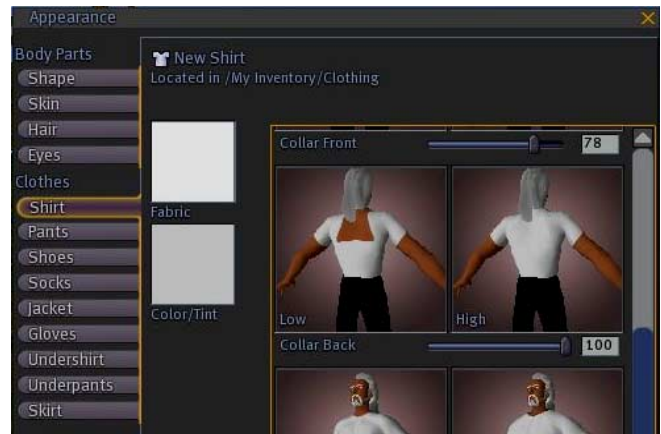
Figure 3. Character creation interface in Second Life

sad if this avatar were deleted by accident" or "I would be willing to sell this avatar to another user."