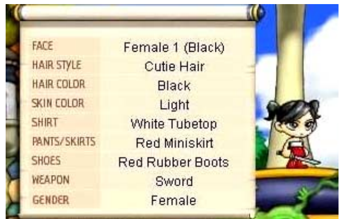
Figure 2. Character creation interface in Maple Story